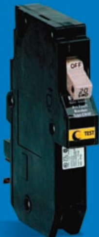
CH115AFPN No pigtail!

Pigtail connections for AFCIs create extra wiring, taking up more wiring space and more valuable time.