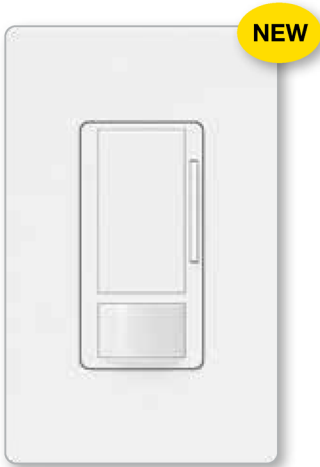
0-10V dimmer sensor