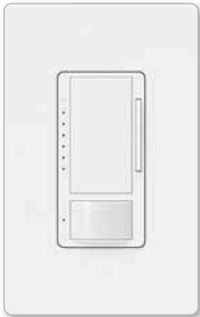
C·L dimmer sensor